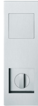
4255 WC- 72 open *