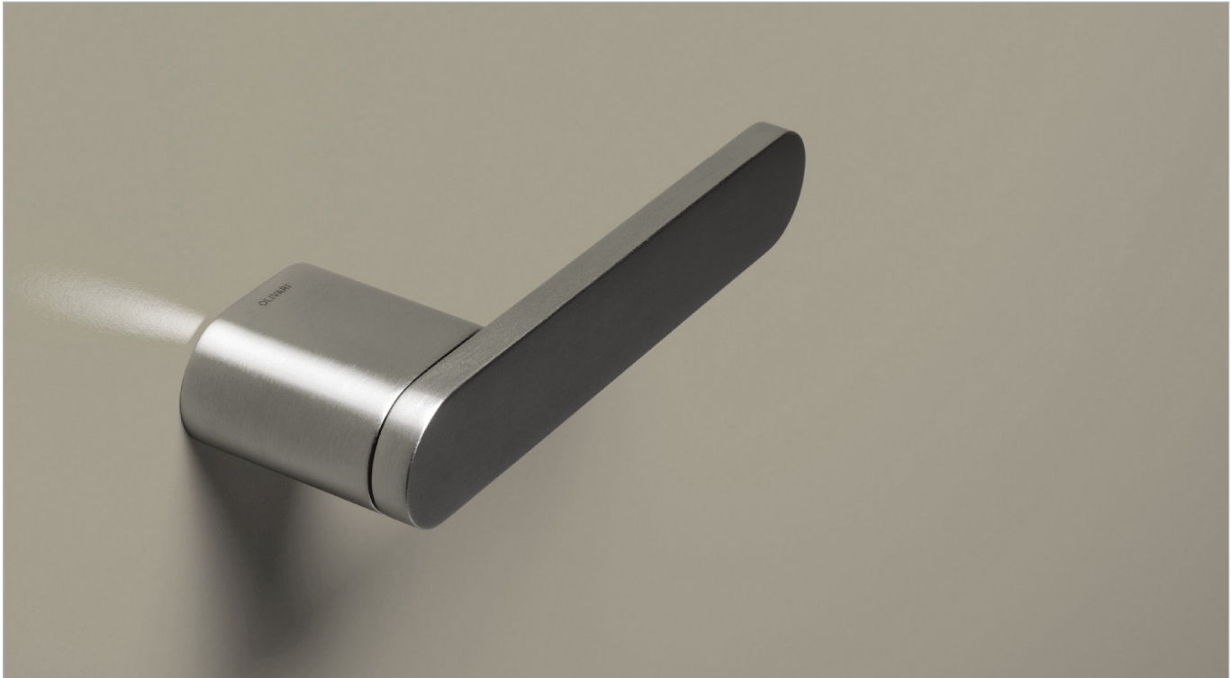
Radial by Olivari

High-quality doors, surfaces and systems – our products stand for clear values. This is why we also have fittings for our doors by the best: FSB, Olivari and Formani. Suitable for the highest standards in design and quality. With perfect functionality. Our focus: Door handles and pulls as an additional stand-alone facet within the interior. The fittings also enjoy the same degree of respect during our careful installation. Everything from one experienced source. And with great attention to detail. In particular in the event of demanding, flush solutions.