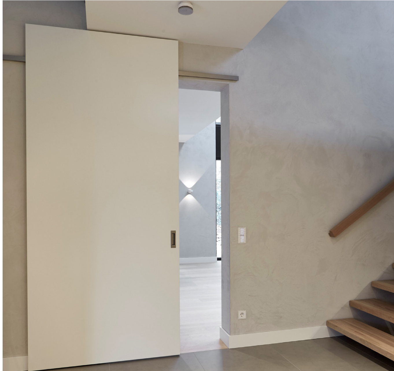
4251 open by FSB