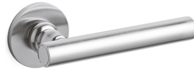
Dolce Vita - chrome