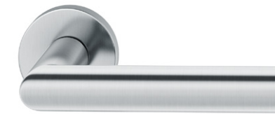
1108 - Stainless steel