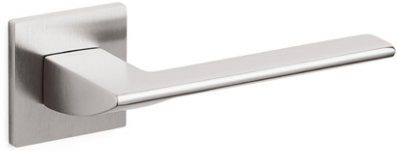
Trend- Stainless steel matte