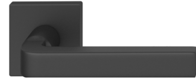
1004 - black anodised