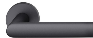
1108 - black anodised

Additional information about our door handles, shell handles and grips can be found at