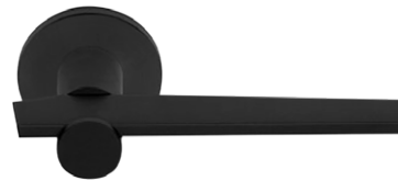
Bertram Beerbaum - Tense 100 black