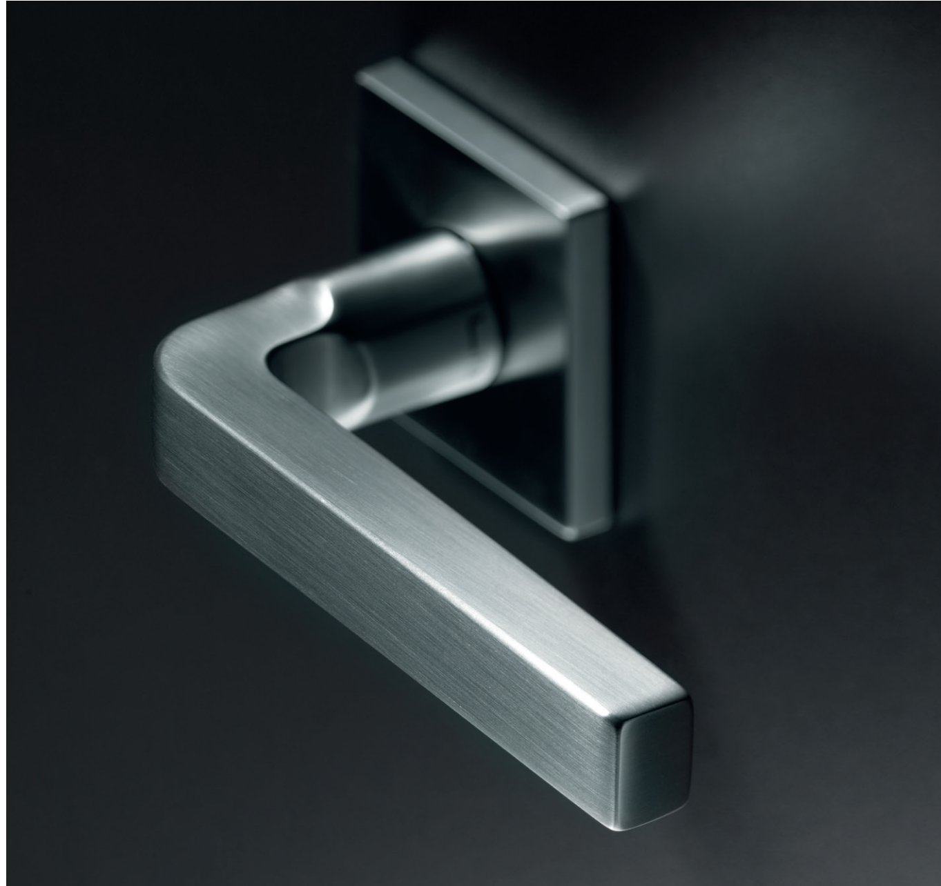
1004 by FSB