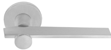
Bertram Beerbaum - Tense 100 stainless steel