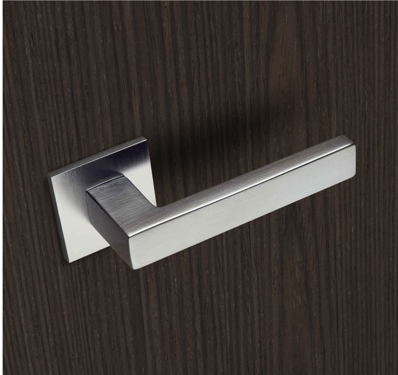
Planet Q by Olivari