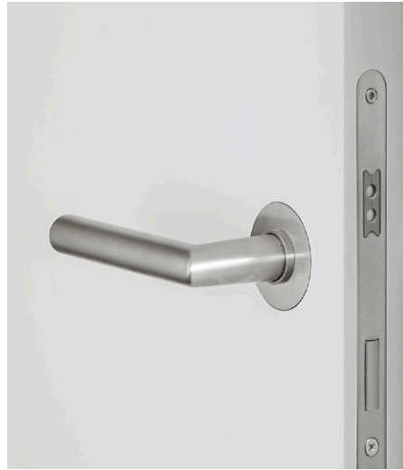
Extra: rose flush