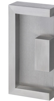
E-Shell stainless steel