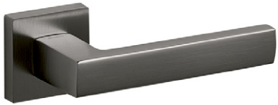
Planet Q- anthracite matte