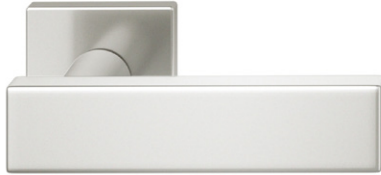
1003 - Aluminium