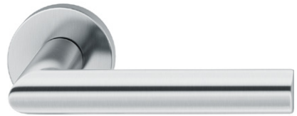
1076 - Stainless steel