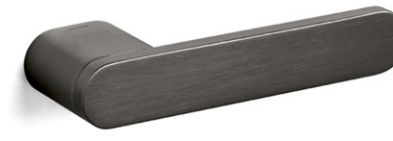
Radial- Anthracite matte

Additional information about our door handles, shell handles and grips can be found at https://www.bodor.eu/product-category/door-fittings/