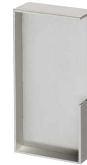
G-Shell stainless steel

Bobby Large grips and C-grips are mounted overlying E-shells and G-shells can only be delivered flush mounted for sliding doors without glazing.