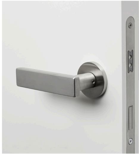
Standard: rose overlying