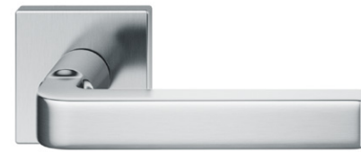
1004 - Stainless steel