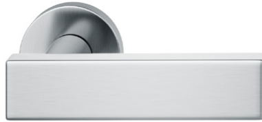
1003 - Stainless steel