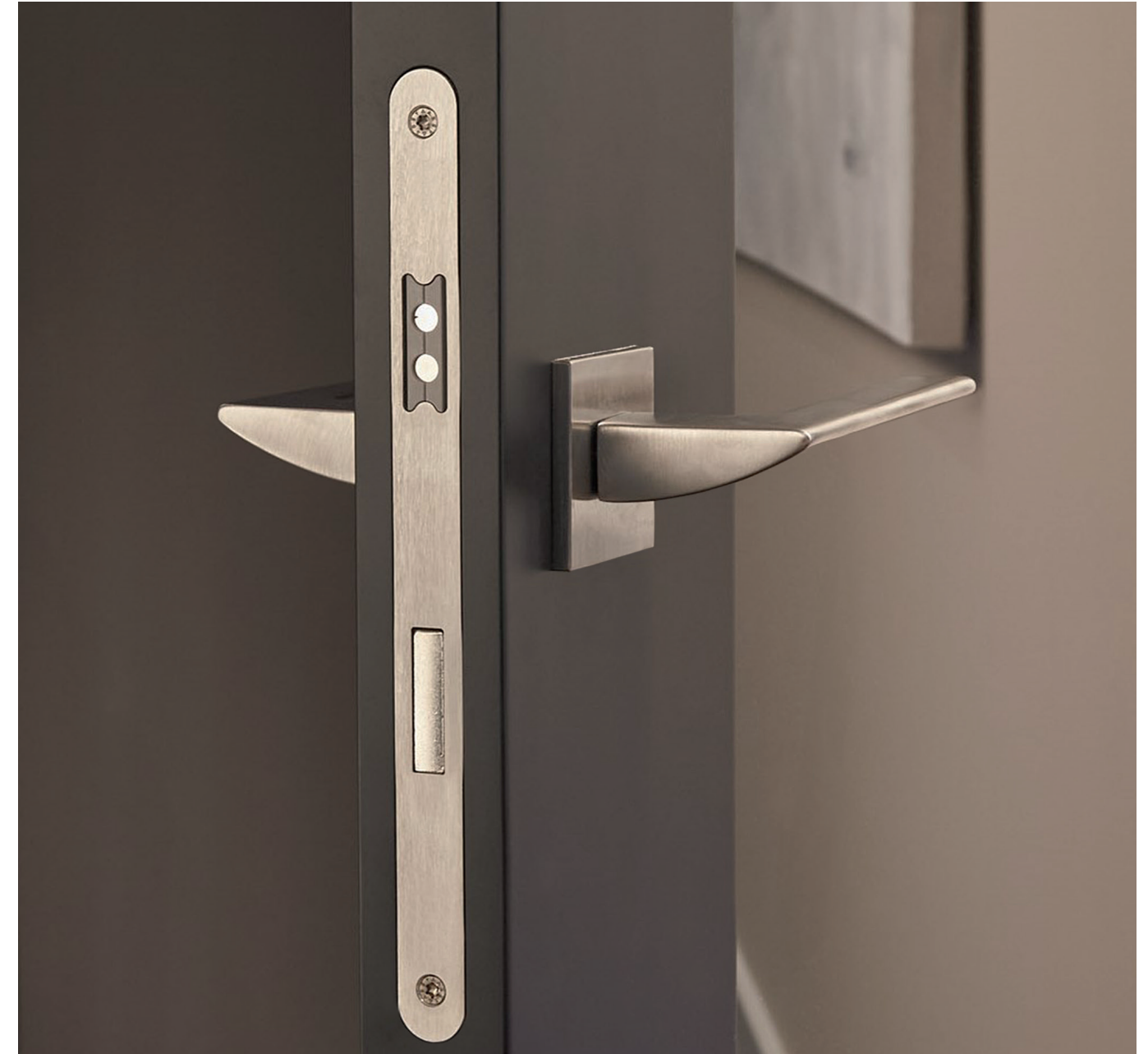
Trend by Olivari

Formani at Bod'or: door handles at page 12