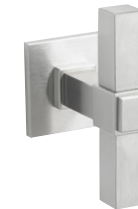
Marcel Wolterinck T/T - stainless steel

Additional information about our door handles, shell handles and grips can be found at https://www.bodor.eu/product-category/door-fittings/