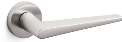
Nina- Stainless steel matte

Handle and key roses latch, cylinder or free-occupied are mounted overlying. Olivari handles can be delivered with stainless steel matte, anthracite matte, or chrome surfaces. Other surfaces are deliverable upon request.