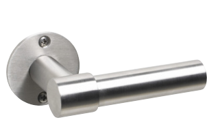
Piet Boon - One L/L stainless steel or matte black