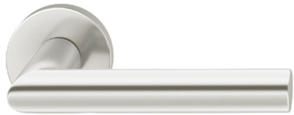
1076 - Aluminium