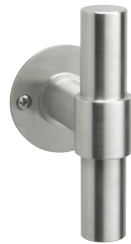
Piet Boon One - T/T stainless steel or matte black