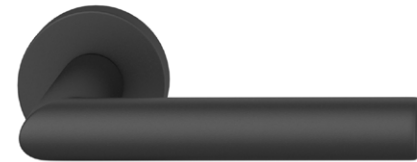
1076 - black anodised