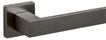
Diana- anthracite matte