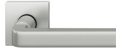
1004 - Aluminium

Handle and key roses latch, cylinder or free-occupied can be mounted overlying or flush. Surface white RAL 9016 or grey RAL 7016 deliverable upon request.