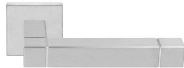
Jan des Bouvrie 100 stainless steel

Handle and key roses latch, cylinder or free-occupied are mounted overlying. Olivari handles can be delivered with stainless steel matte, anthracite matte, or chrome surfaces. Other surfaces are deliverable upon request.