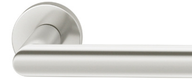
1108 - Aluminium