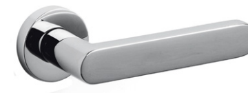
Link - Stainless steel matte