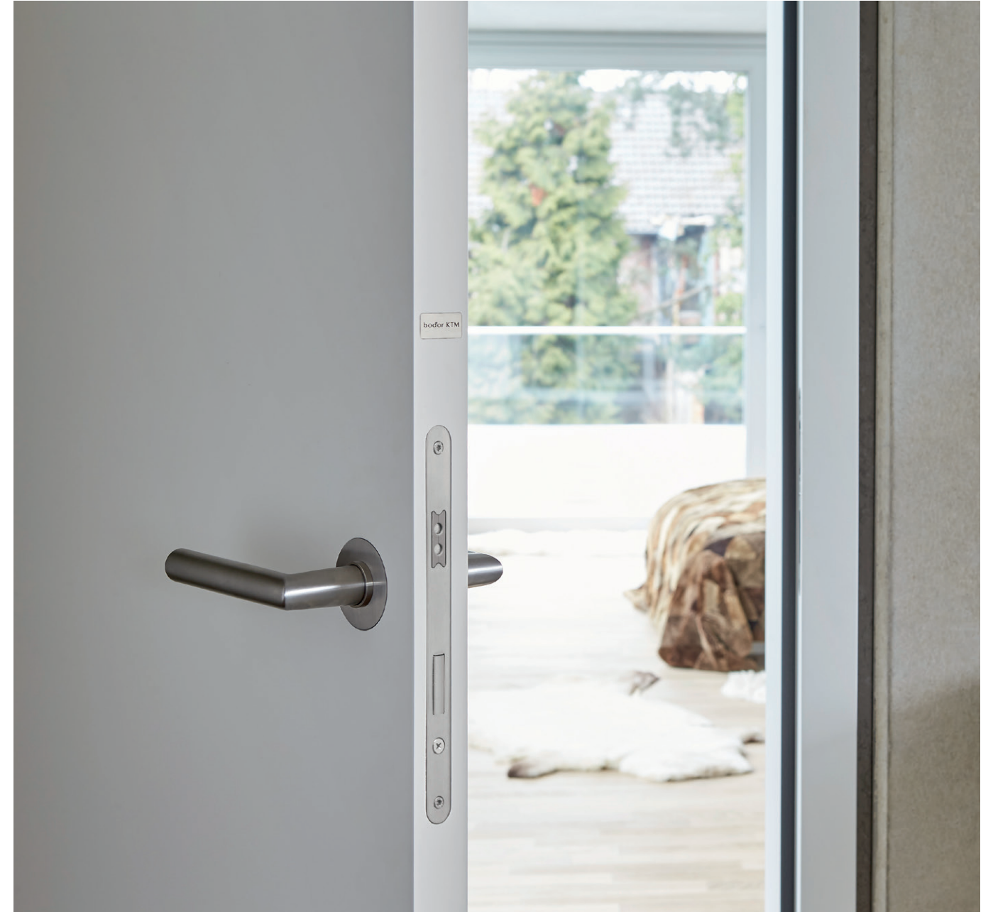
1076 by FSB