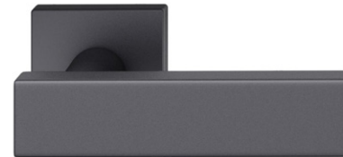
1003 - black anodised

Roses can be delivered in round or square.